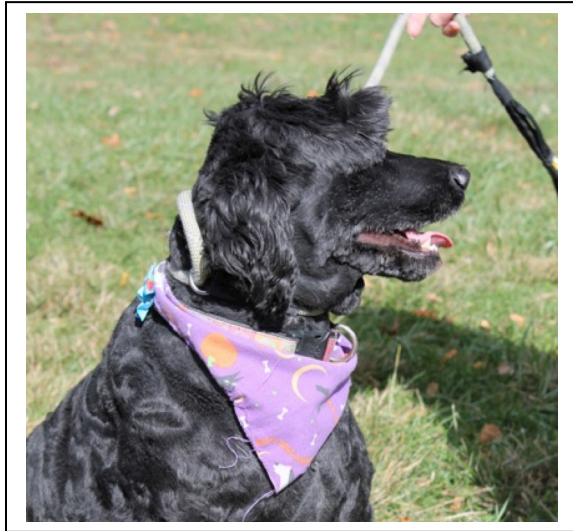
Fun at the Annual Keystone Picnic